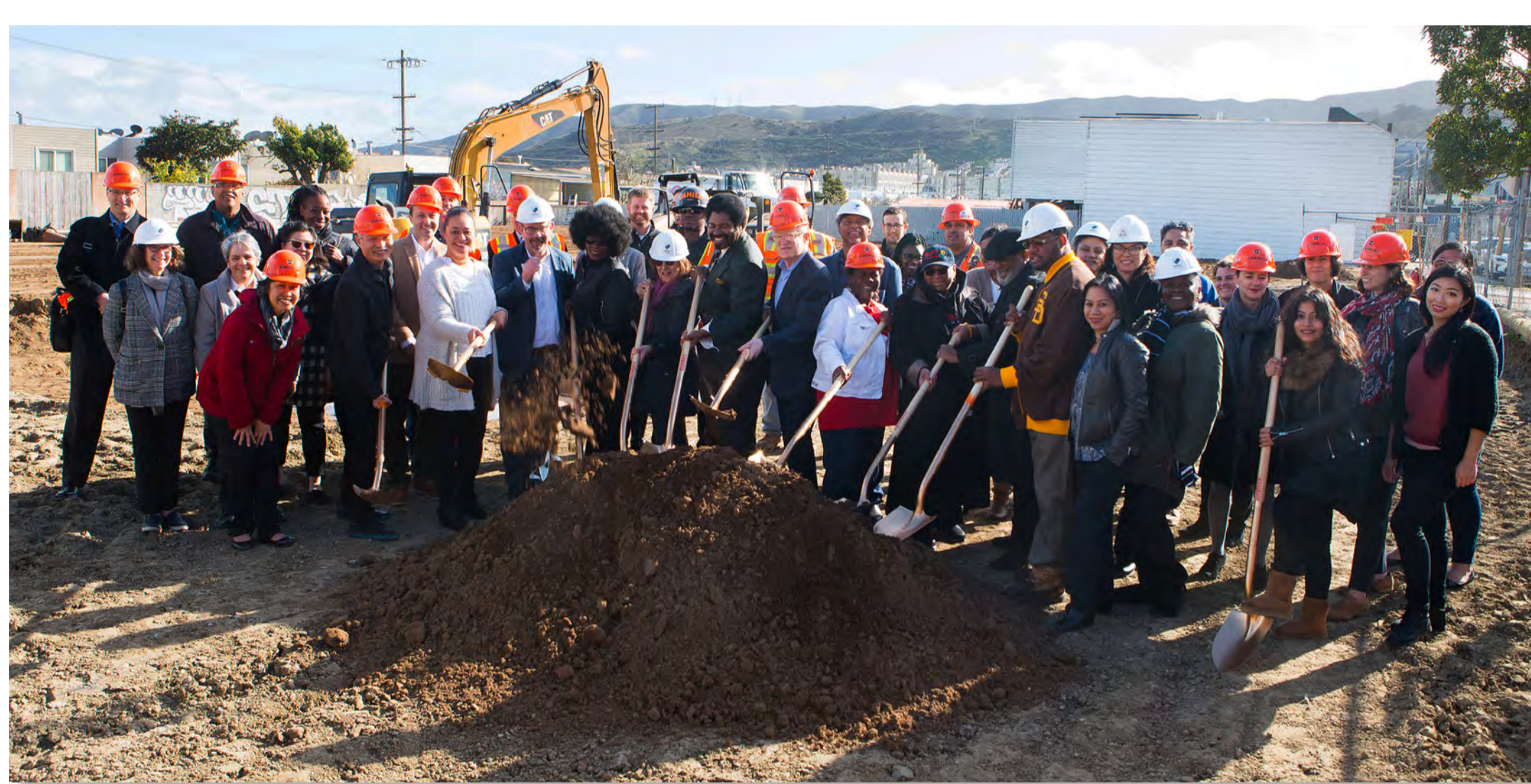
Mercy Housing, Related California and City Officials

After ten years of planning with residents, HOPE SF leadership, the Mayor's Office of Housing and Community Development, Mercy Housing California and Related California commemorated the groundbreaking of phase one of the redevelopment of the Sunnydale neighborhood that will consist of a 55-unit affordable development for low and very-low income families and provide permanent replacement housing for existing Sunnydale and Velasco residents. Once complete, the new mixed-income Sunnydale will consist of 775 units of replacement housing plus another 900 units of tax-credit affordable and market rate housing integrated around a new recreational and educational center, parks, a community garden, neighborhood serving retail and pedestrian-oriented blocks. Completion of phase one is scheduled for 2019. ▶