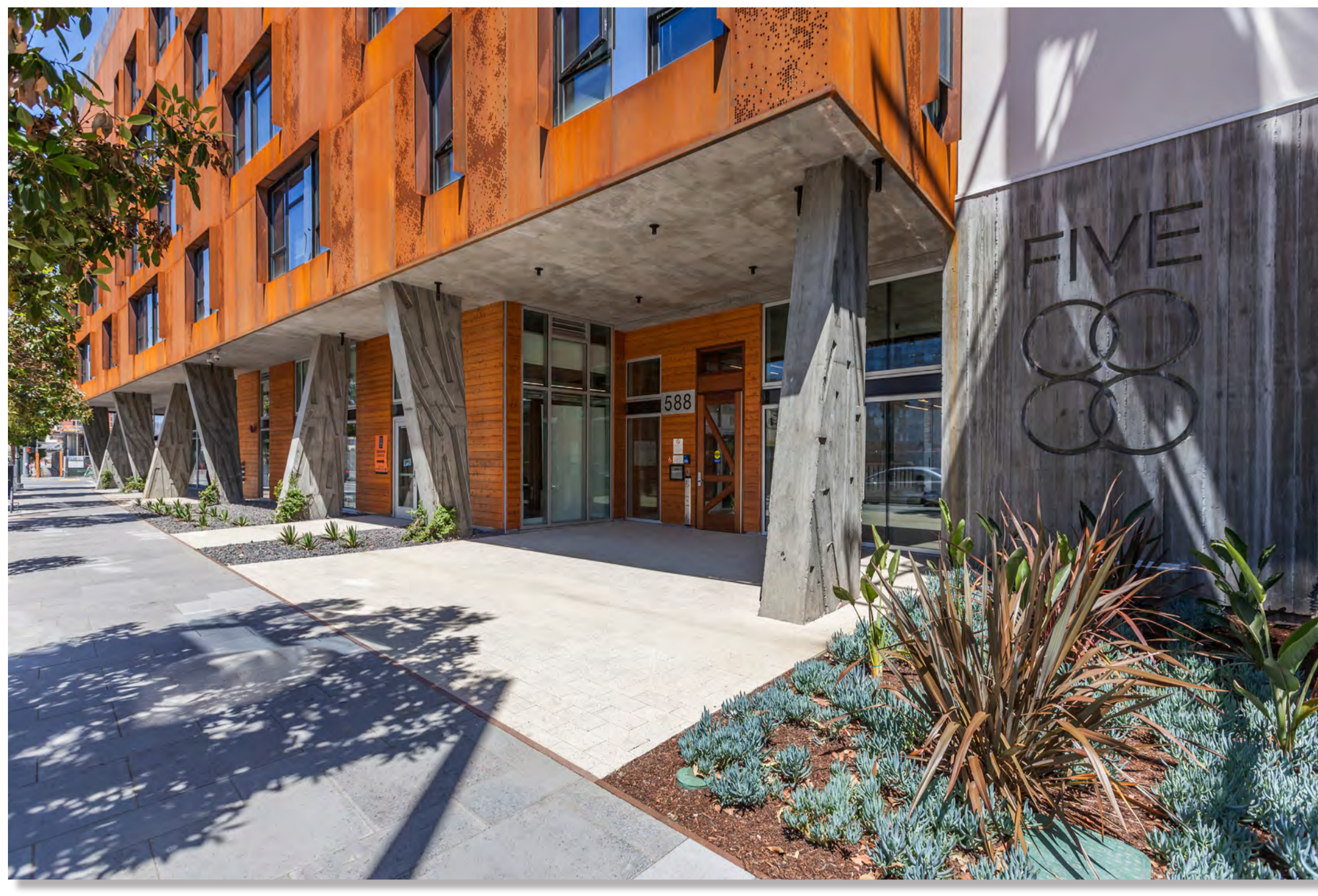
Five 88 Exterior

The American Institute of Architects in San Francisco (AIA SF) recently honored Five 88 as one of this year's Design Awards winners. Designed by David Baker Architects and developed by Related California in partnership with Chinatown Community Development Corporation and the City of San Francisco's Office of Community Investment and Infrastructure, Five 88 is the largest subsidized affordable, mixed-use, transit-oriented development in San Francisco in more than a decade, and garnered a Merit Award for architecture with a Special Commendation for social responsibility. AIA SF has been serving the Bay Area for over a century and represents over 2,300 members practicing architecture and 4,000 allied community professionals in San Francisco and Marin County fostering community involvement, education, advocacy, public outreach, member services and professional excellence.