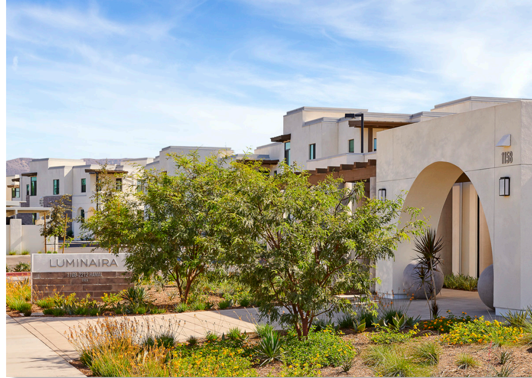
Luminaira, Irvine Best Affordable Housing Community (under 30 du/acre) 82 Units