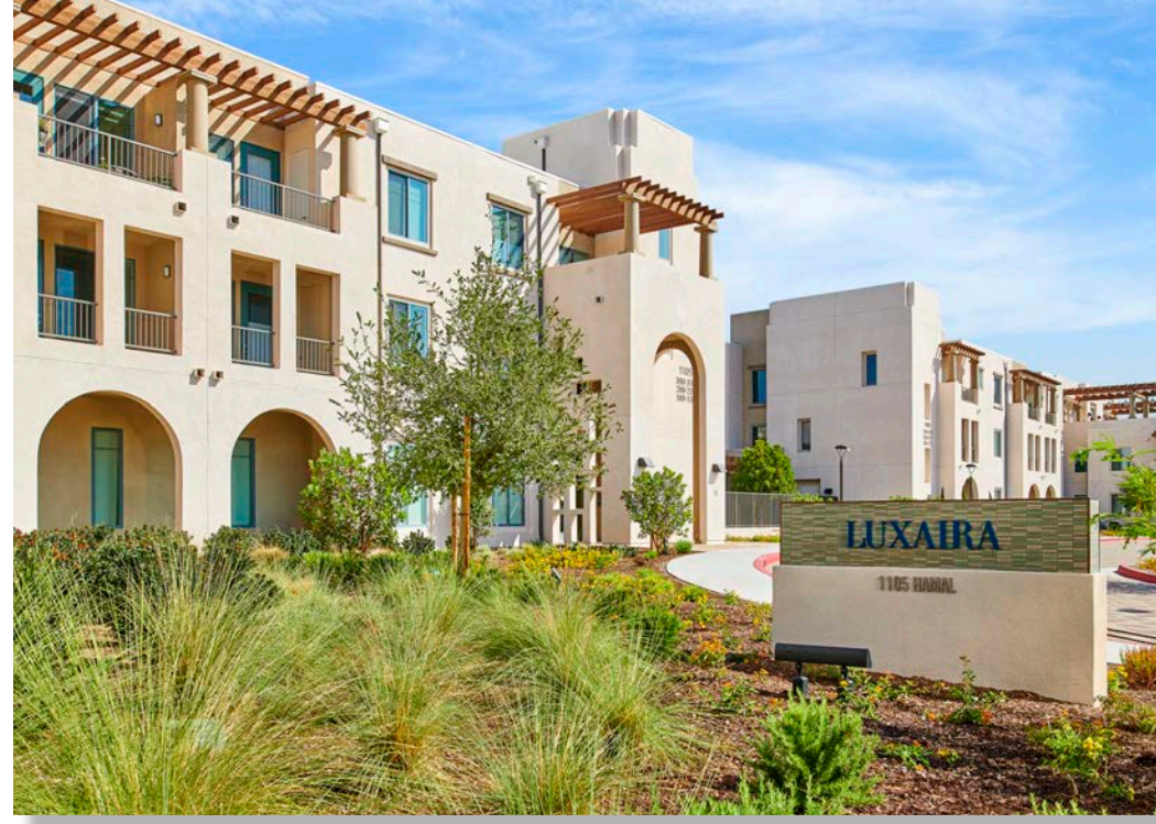
Luxaira, Irvine Best Affordable Senior Housing Community 170 Units