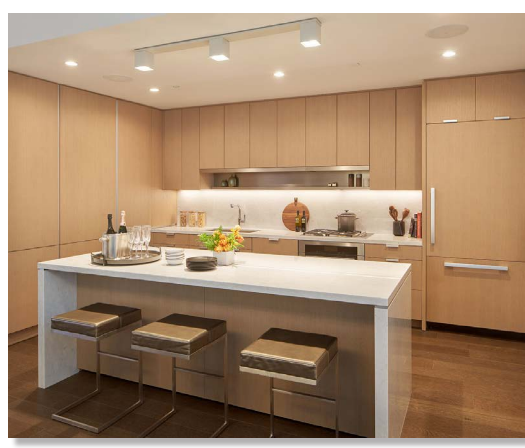
The Avery Sales Gallery

Condo sales have begun at The Avery, the 56-story, 618 foot architectural statement designed by Rem Koolhaas' Office of Metropolitan Architecture. Located in the new heart of San Francisco, the 118 condominium residences, starting on the 33rd floor, will offer views of the San Francisco Bay, the Bay Bridge and city skyline. Stunning interiors of the one, two and three bedroom residences and penthouses are by acclaimed Clodagh Design, in addition to the amenity spaces. When complete, the mixed-income residential tower will consist of 548 residences and 17,000 square feet of retail. Move-ins at The Avery are scheduled for early to mid 2019. ▶