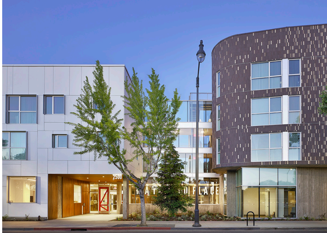
Mayfield Place, Palo Alto Best Affordable Housing Community (30-60 units/acre) 70 Units

Now in its 55th year, Gold Nugget Awards is the largest and most prestigious competition of its kind in the nation and draws entries from throughout the United States and internationally. It honors design and planning achievements in community and home design, green-built housing, site planning, commercial, retail, mixed-use development and specialty housing categories. This year's winners were chosen from more than 700 entries around the world. To date, Related has been the recipient of 44 Gold Nugget Awards.