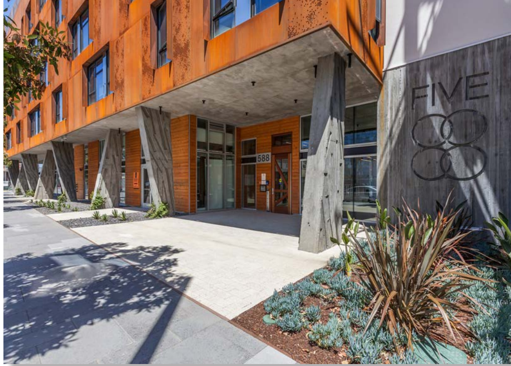
Five 88, San Francisco Best Affordable Housing Community (100 du/acre or more) 200 Units