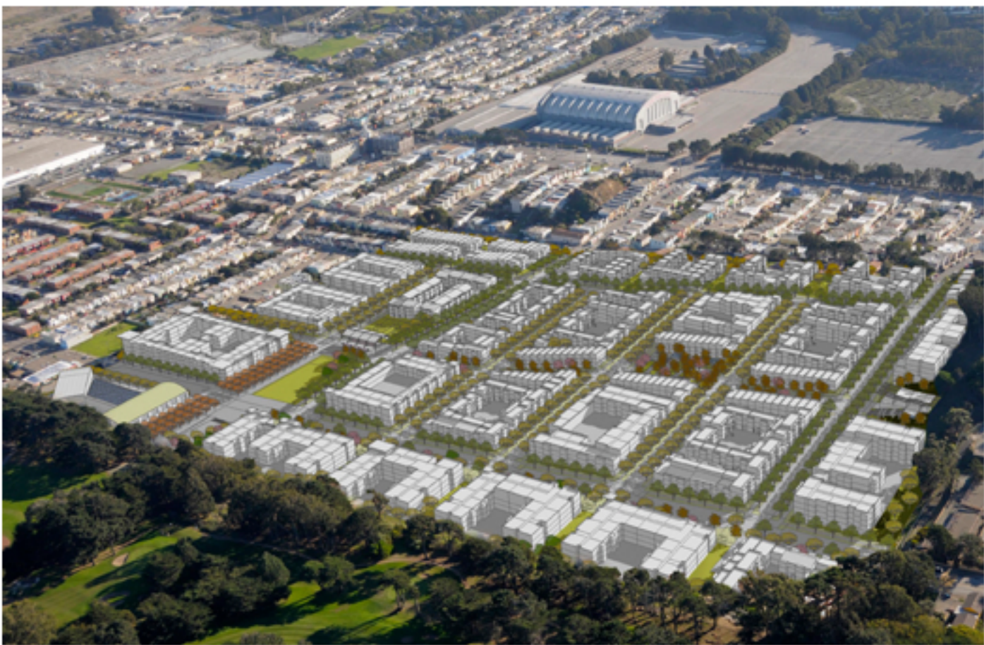
Master Plan View Looking West

The San Francisco Board of Supervisors’ historic vote authorized the transformation of dilapidated public housing in Sunnydale in San Francisco and paves the way for the partnership of Related California and Mercy Housing to transform 778 public housing units with up to 1,700 mixed-income housing, ranging from very low to market rate.