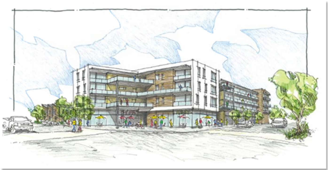
Sunnyvale Exterior Rendering

The Mayor’s Office of Housing and Community Development (MOHCD) awarded Related California and Mission Housing Development Corporation the development rights for 90 units of affordable and supportive housing in San Francisco’s Excelsior neighborhood, one component of a new, transit-oriented, mixed-use development located on 1.8 acres of City-owned and BART-owned parcels. Related is currently working with Caritas Management Corporation, Falcone Development Services, Instituto Familiar del La Raza, Jamestown Community, YMCA and Lutheran Social Services to provide community space and services. ▶