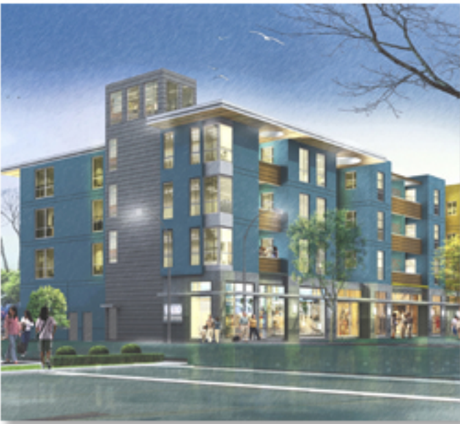
East Oakland 94 International

2015 Los Angeles Business Council Architectural Award – LADWP Community Impact Award