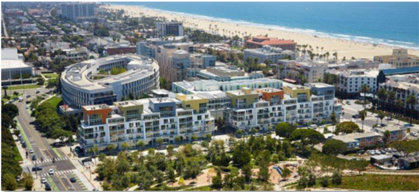
Ocean Avenue South

Related California, in partnership with Chinatown Community Development Center, has started construction on an affordable, mixed-use development comprised of 200 apartments and 10,000 square feet of retail located on the 4th Street Corridor and between China Basin Street and Mission Bay Boulevard North, within San Francisco's Mission Bay neighborhood. Adjacent to the 3rd Street Light Rail and with access to the city's bicycle network from 4th Street, the development is designed from sustainability, including 306 secure bicycle parking spaces, landscaped pedestrian mews, solar panels and drought tolerant landscaping. Completion is expected in early 2017.