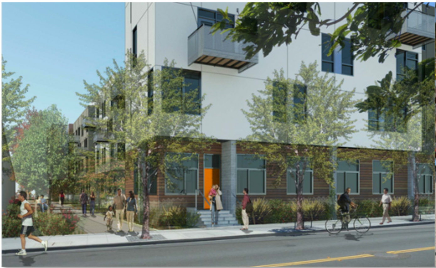
Mission Bay Block 7

Related California, in partnership with Chinatown Community Development Center, has started construction on an affordable, mixed-use development comprised of 200 apartments and 10,000 square feet of retail located on the 4th Street Corridor and between China Basin Street and Mission Bay Boulevard North, within San Francisco's Mission Bay neighborhood. Adjacent to the 3rd Street Light Rail and with access to the city's bicycle network from 4th Street, the development is designed from sustainability, including 306 secure bicycle parking spaces, landscaped pedestrian mews, solar panels and drought tolerant landscaping. Completion is expected in early 2017.