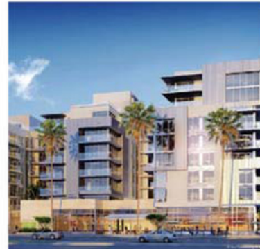
COMMUNITY WATCH Local architectural firm Moore Ruble Yudell's design for The Seychelle, one of two properties at Ocean Avenue South.

architects and designers to create an entirely new way of living. Designed by the architectural firm Moore Ruble Yudell, the LEED-certified buildings include 20,000 square feet of retail and dining space (including a Westside outpost of Joan's on Third), as well as gardens landscaped by Mia Lehrer. Just steps from the beach, the 3.7-acre complex offers one- to three-bedroom units and luxury penthouses (one's just been listed for $10 million) within its two distinctive properties, The Waverly and The Seychelle. First to debut was The Waverly, with interiors by Marmol Radziner. (Think oak floors and polished quartzite—the kind of earthy, contemporary styling for which the firm is lauded.) The dual six-story towers contain 65 homes and boast generous windows and balconies. Bridging the structures is a fifth-floor residents' lounge. For The Seychelle, the larger of the two properties with 93 units,